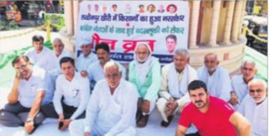
गोहाना में सोमवार को अबैडकर चौक पर मौन व्रत पर बैठे कांग्रेस कार्यकर्ता।