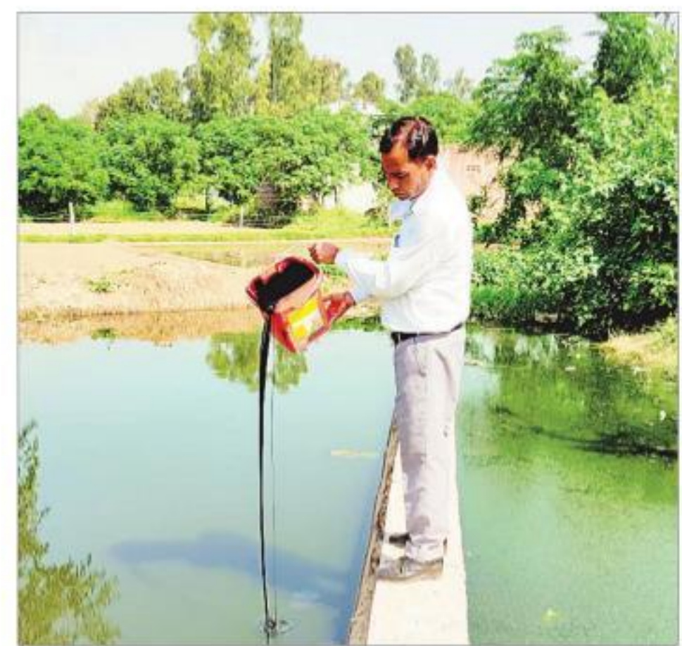
Used oil being spilled in a waterbody in Ambala.

While two of the accused have been remanded in one-day police remand, the woman has been sent to judicial custody. The fourth accused, who carried out a recce to carry out the plan, is yet to be arrested.