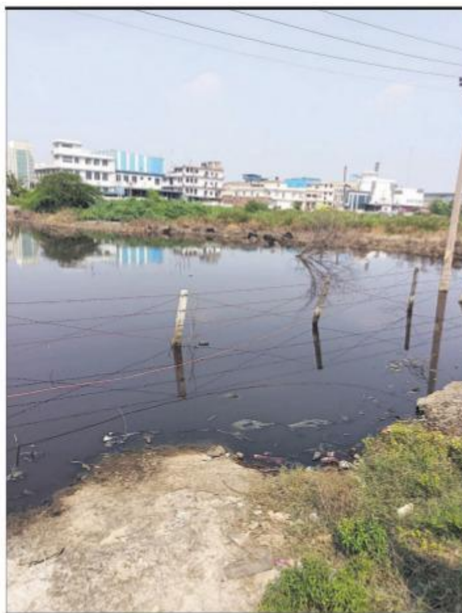
Over 450 MLD of waste is generated daily in the city against a treatment capacity of 120 MLD at present.

problem of stagnated untreated waste water in the industrial sector of 58