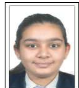
JIA ROHILLA SOCIAL SCIENCE