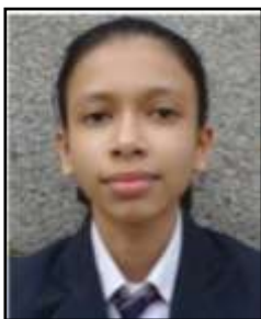
VAGMI SOCIAL SCIENCE