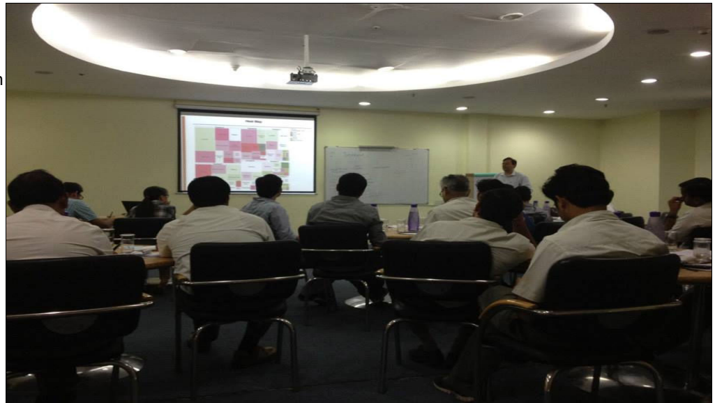
Management Development Program at Maruti Suzuki India Limited

6th National Conference on Contemporary Management & Research: 17th October 2014