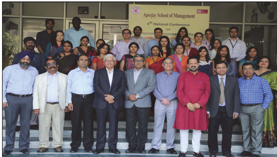
6th National Conference

Annual Fest Synergy: 28th & 29th November