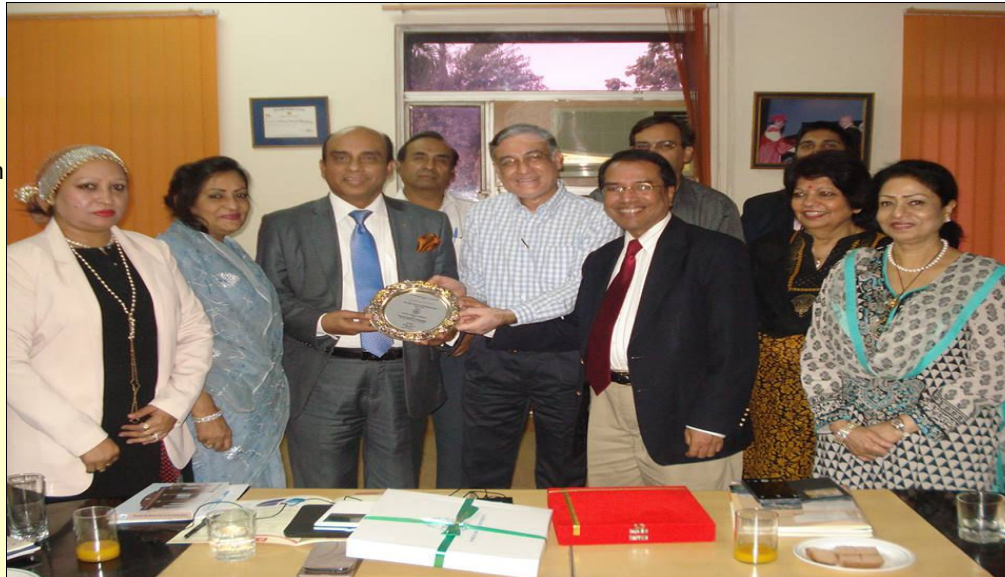
Visitors from a reputed University in Dhaka

5th International Conference On Management Practices & Research : 24th July, 2015