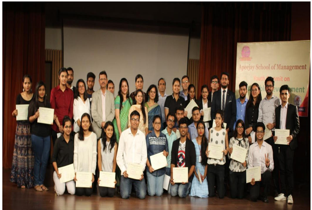
Youth Summit on Sustainable Development