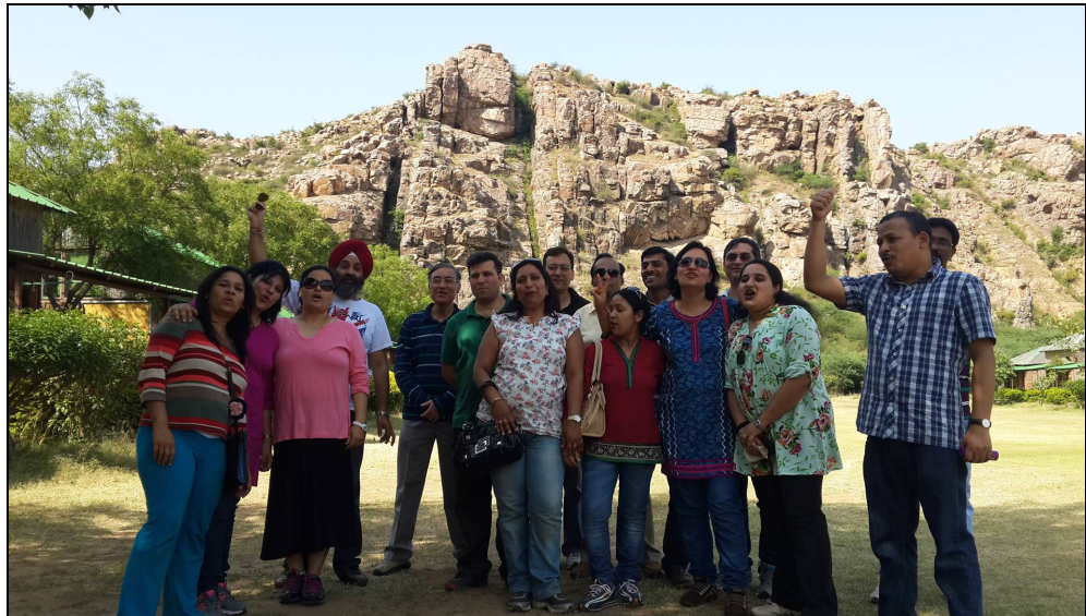
Faculty Trip to Camp Wild Dhauj

6th National Conference on Contemporary Management. & Research: 17 October 2014