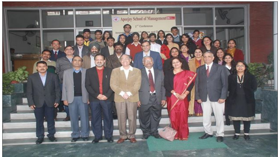
Conference on Innovative Financial Practices and Developments

4th International Conference on Management Practices & Research, ICMPR 2014: 25 July 2014