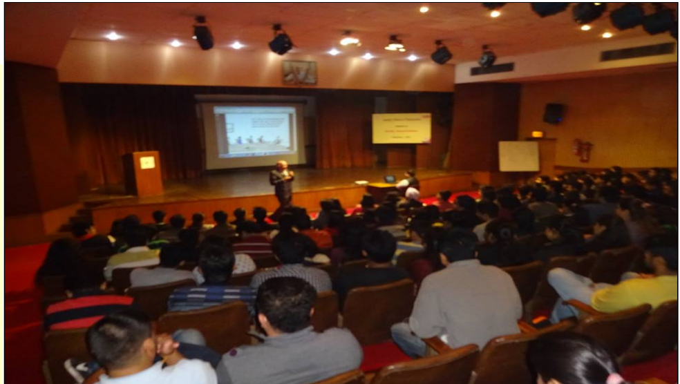
Seminar on Big Data: Issues and Challenges

Conference on Information Technology and Operations Management: 6 May 2016