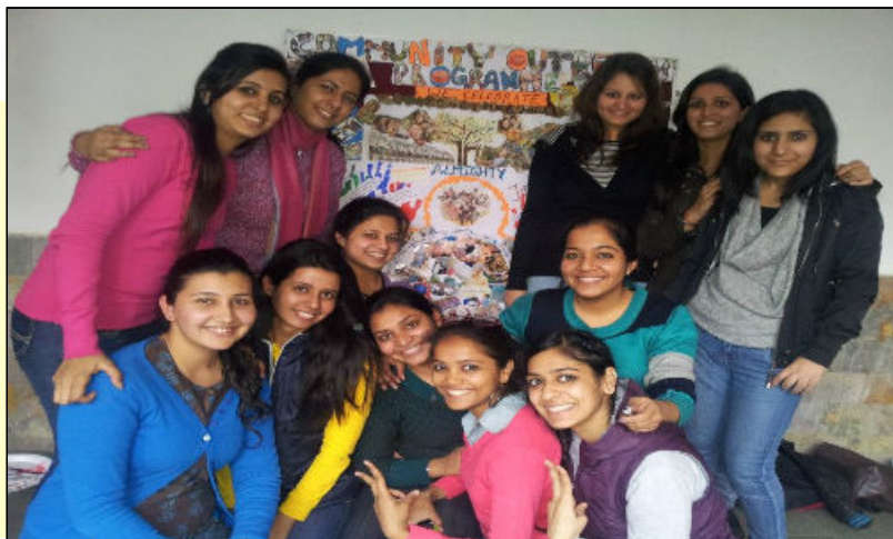
Students of ASM at Collage-making Competitions