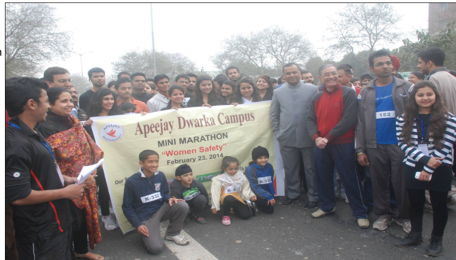
Mini Marathon for Women's Safety

4th International Conference on Management Practices & Research, ICMPR 2014: 25 July 2014