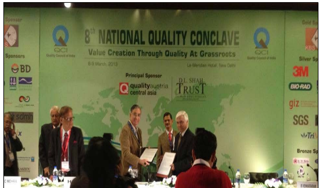
Quality Research Center setup at ASM

International Conference on Management Practices & Research 26 July 2013